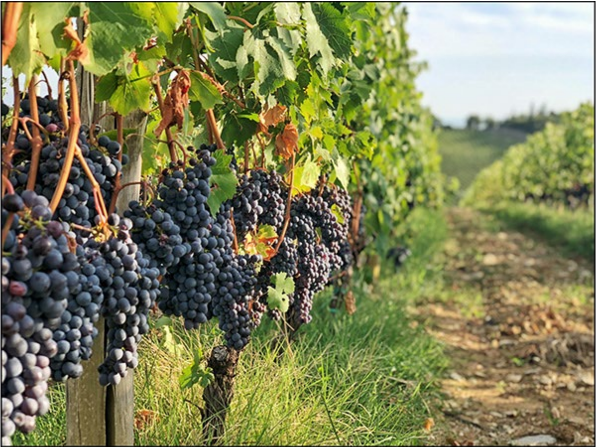
Fruit in the Bellavista vineyard absorbs the last days of sun before harvest.

The Vigneto Bellavista is the first parcel you see as you drive up to the property entrance. It sees an ideal mix of Alberese limestone soils that are typical of this area. The vineyard is planted to Sangiovese and Malvasia Nera, with the latter grape rendering delicate floral intensity in the wine. The Vigneto La Casuccia is located at the back of the main villa and is recognized by a funny little house located in the middle of the vines. The Casuccia area has three parcels with Sangiovese and Merlot. Lastly, we have the Chianti Classico Gran Selezione San Lorenzo that gets its name from the San Lorenzo valley that can be seen from the villa. This wine represents a selection of fruit from various vineyards including Bellavista, Casuccia, San Lorenzo and Montebuoni. The wine itself is Sangiovese touched with very smaller percentages of Merlot and Malvasia Nera.