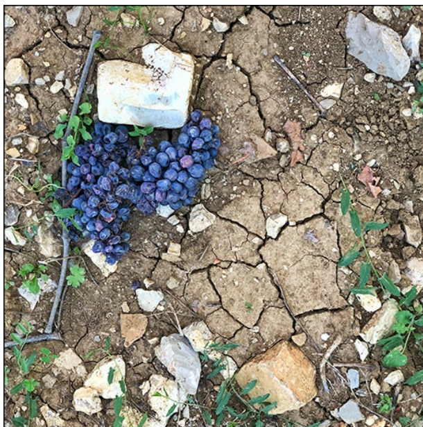
Here are the characteristic Alberese limestone soils of the Bellavista vineyard.