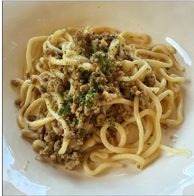
Pici al ragù served at the Castello di Ama restaurant makes a perfect pairing to the accessible 2018 Chianti Classico Ama